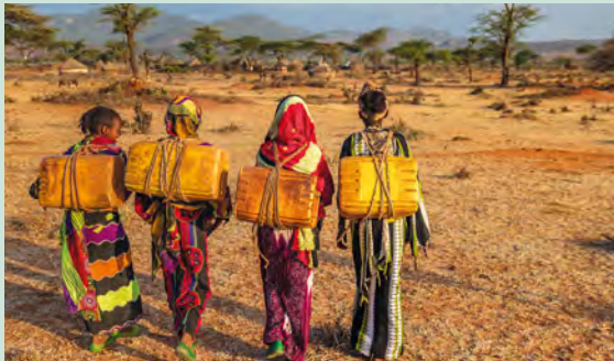
Support the Global South