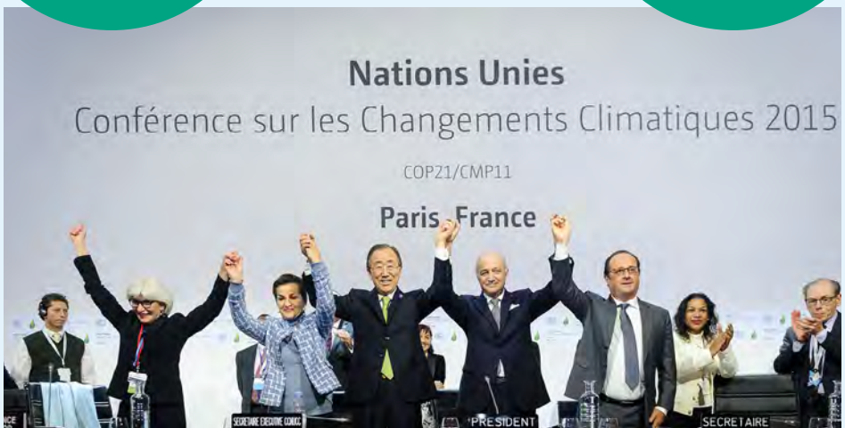
Adoption of the Paris Climate Agreement 2015