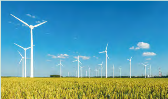
Protect the climate

Faster and stronger agreements at UN summits for, among other things, more effective climate protection and the preservation of biodiversity.